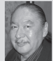
Elijah Harper "Breaking Silence/ Breaking Barriers"