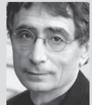
Dr. Gabor Mate In The Realm of Hungry Ghosts: Close Encounters with Addiction