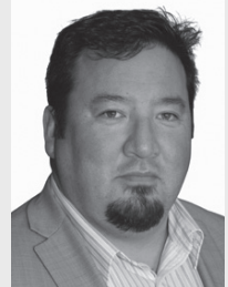
Grand Chief Derek Nepinak Assembly of Manitoba Chiefs