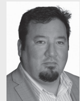
Grand Chief Derek Nepinak Assembly of Manitoba Chiefs