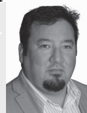
Grand Chief Derek Nepinak Assembly of Manitoba Chiefs