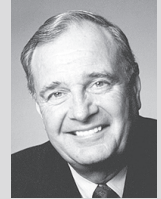
The Right Honourable Paul Martin, P.C., C.C.