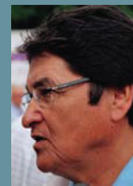
Keynote Speaker: Councillor Ovide Mercredi of Misipawistik Cree Nation (Grand Rapids First Nation) is a lawyer, a negotiator, an author, a lecturer in Native Studies, and an activist on behalf of First Nations in Canada.

* Discounted rates for accommodations and flights is also available. Call for details.