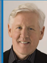
The Hon. Bob Rae, Chief Negotiator, Matawa First Nations, and Former Leader, Liberal Party of Canada