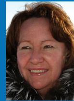
Sheila Watt-Cloutier, Environmental and Human rights Activist and Nobel Peace Prize Nominee