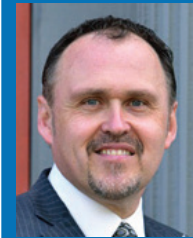
The Hon. Darrell Pasloski Premier, Government of Yukon