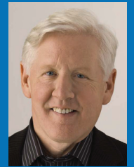
The Hon. Bob Rae Chief Negotiator, Matawa First Nations, and Former Leader, Liberal Party of Canada