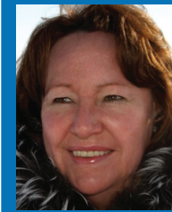
Sheila Watt-Cloutier Environmental and Human rights Activist and Nobel Peace Prize Nominee