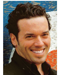
Keynote Speaker: Joseph Boyden

First 100 Students FREE ADMISSION! Register today!