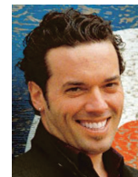
Keynote Speaker: Joseph Boyden

First 100 Students FREE ADMISSION! REGISTER NOW!