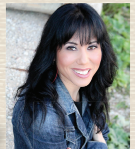
Leah Gazan University of Winnipeg